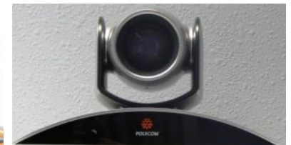
Polycom VTC equipment generously donated to ACSA by GCI School Access